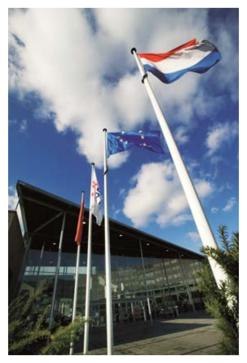
(MECC MAIN ENTRANCE)